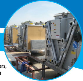
(16) TrilliumSeries Coolers, DFCV-S 9026-M616-B-AD

Malaga Airport is the fourth busiest airport in Spain, it handles over 12 millions passengers a year. An airport with such features and a steady growth needs a good infrastructure. For the new passenger terminal, several innovations, amongst which improved access to the airport, parking spaces and the second runway, will convert Malaga Airport to one of the most modern airports in Europe.