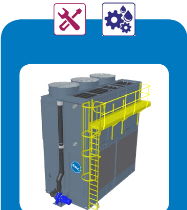
External platform with ladder & casing railing