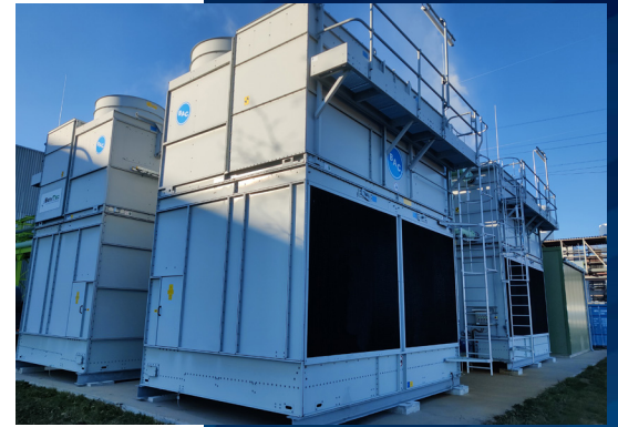
(4) FXVS 1218C-32Q-P