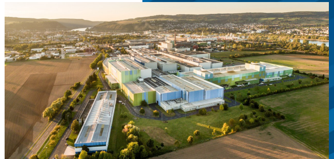
thyssenkrupp, Andernach Germany