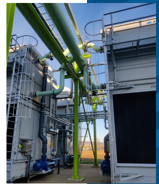
Easy and safe access to the top of the unit via the ladder, cage and platform