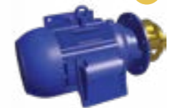
Spray pump without volute